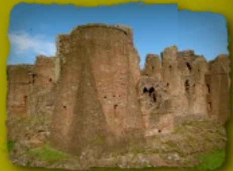
goodrich castle - herefordshire

understand another aspect of NLI's call - vision casting the need in Europe and how individuals and churches can be included.