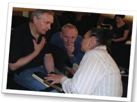
Speaking with church planters

community. A number of them shared how God opened the door to minister where they live because they have engaged in the life of their town. Going to schools to share about moral foundations for life, caring for the poor, taking a leader's role in the community proves to be the way that God pours out His blessing.