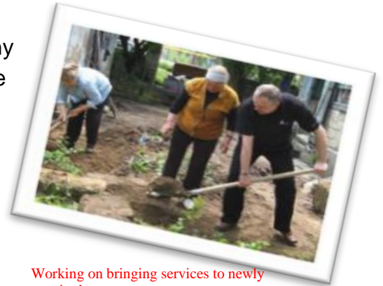
Working on bringing services to newly acquired property.