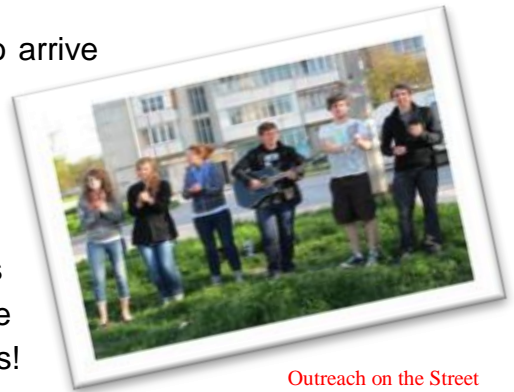
Outreach on the Street

A team of 26 interns from Christian Life Assembly was to arrive on April 15 but the volcano eruption prevented us from crossing the Atlantic. It was truly a miracle to get 26 tickets on another flight just a few days later. We arrived in sunny Simferopol almost a week late where we spent one night. The following morning we divided into 3 groups and traveled to various places to minister together with the newly appointed church planters. And what a time it was! These teams went to schools sharing with the young Crimeans about life in Canada, and then challenged them to a Canada-Crimea game of soccer or volleyball. Following the game was usually an appeal for salvation.